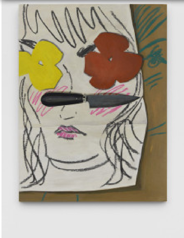
EXHIBITIONS Srijon Chowdhury at Foxy Production, New York (Read more)