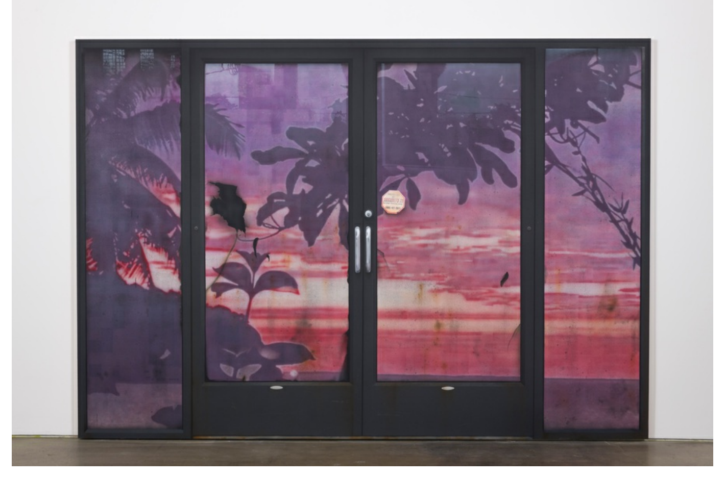
Full gallery of images, press release and link available after the jump. Images: