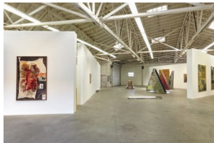
9 View of JPW3's "32 Leaves, I Don't the Face of Smoke," Night Gallery, Los Angeles, 2014.