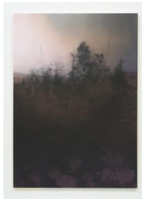
7 Sayre Gomez, Untitled Painting, II , 2014.