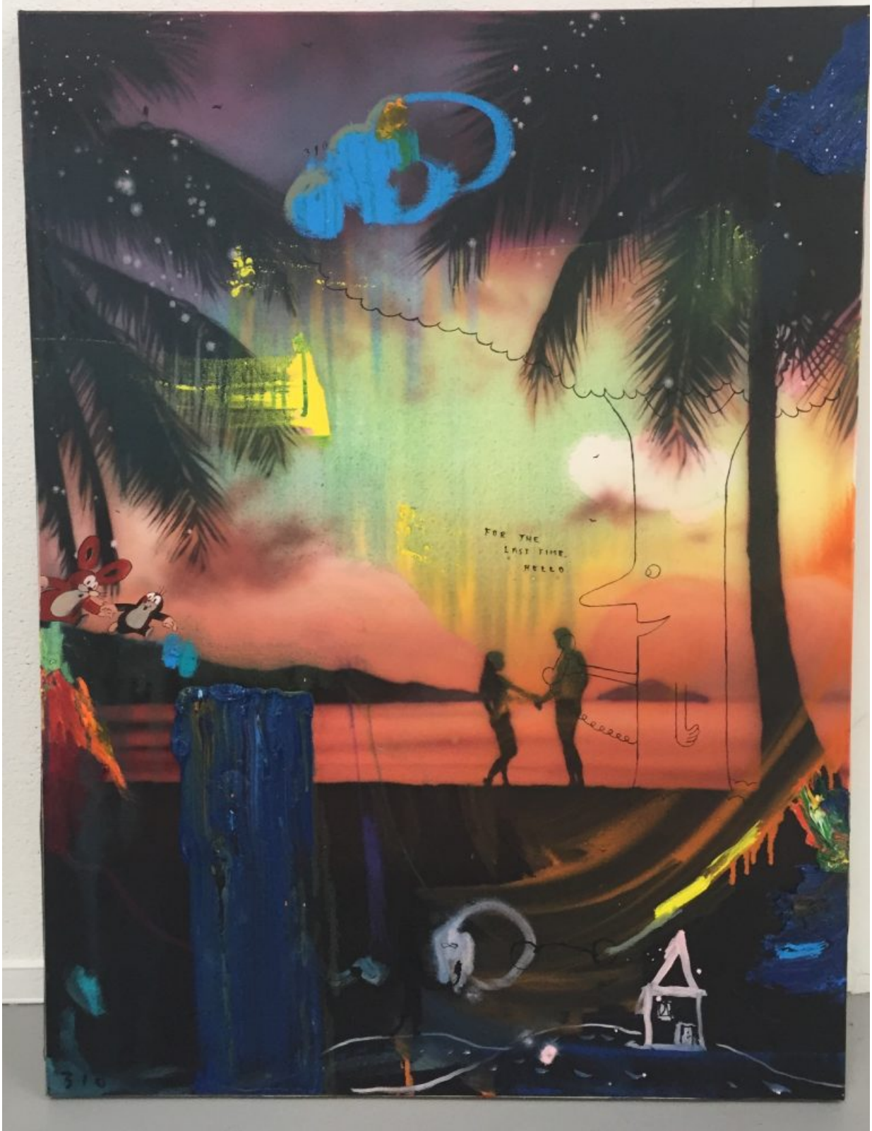
Friedrich Kunath, For the Last Time, Hello (2020).