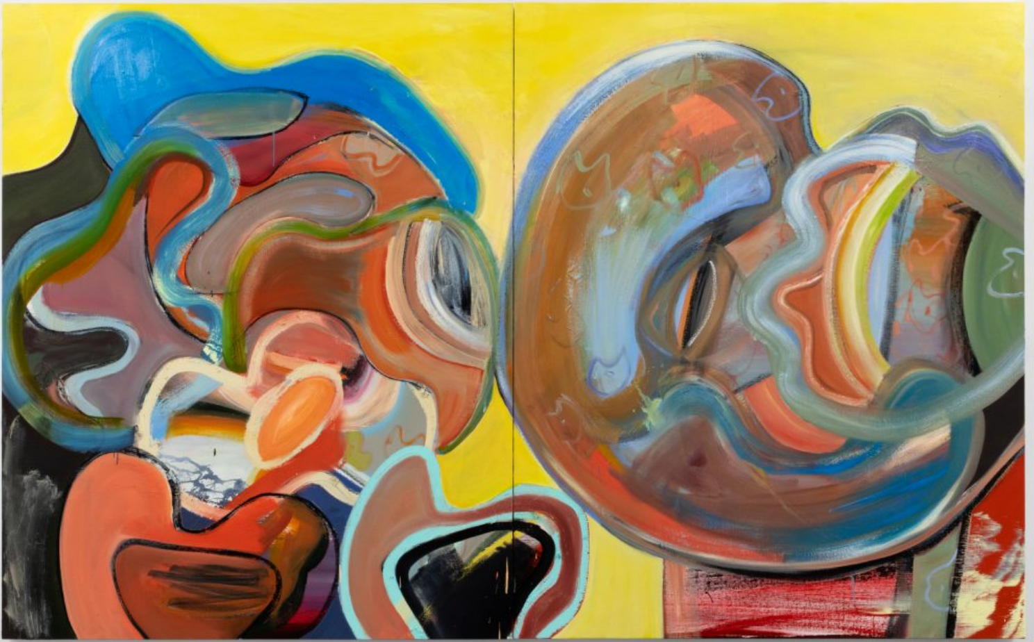
Austyn Weiner, Working Through Not Knowing a Damn Thing About Any Thing (2020).