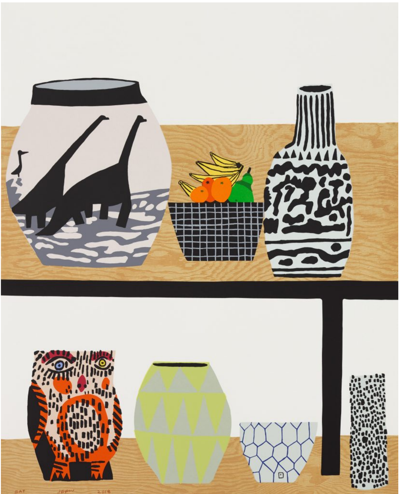
Jonas Wood, Shelf Still Life (2015).