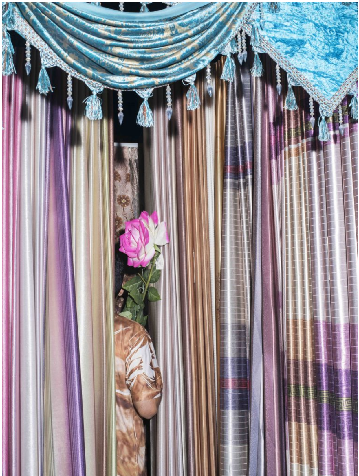
Farah Al Qasimi, Curtain Shop (2019).