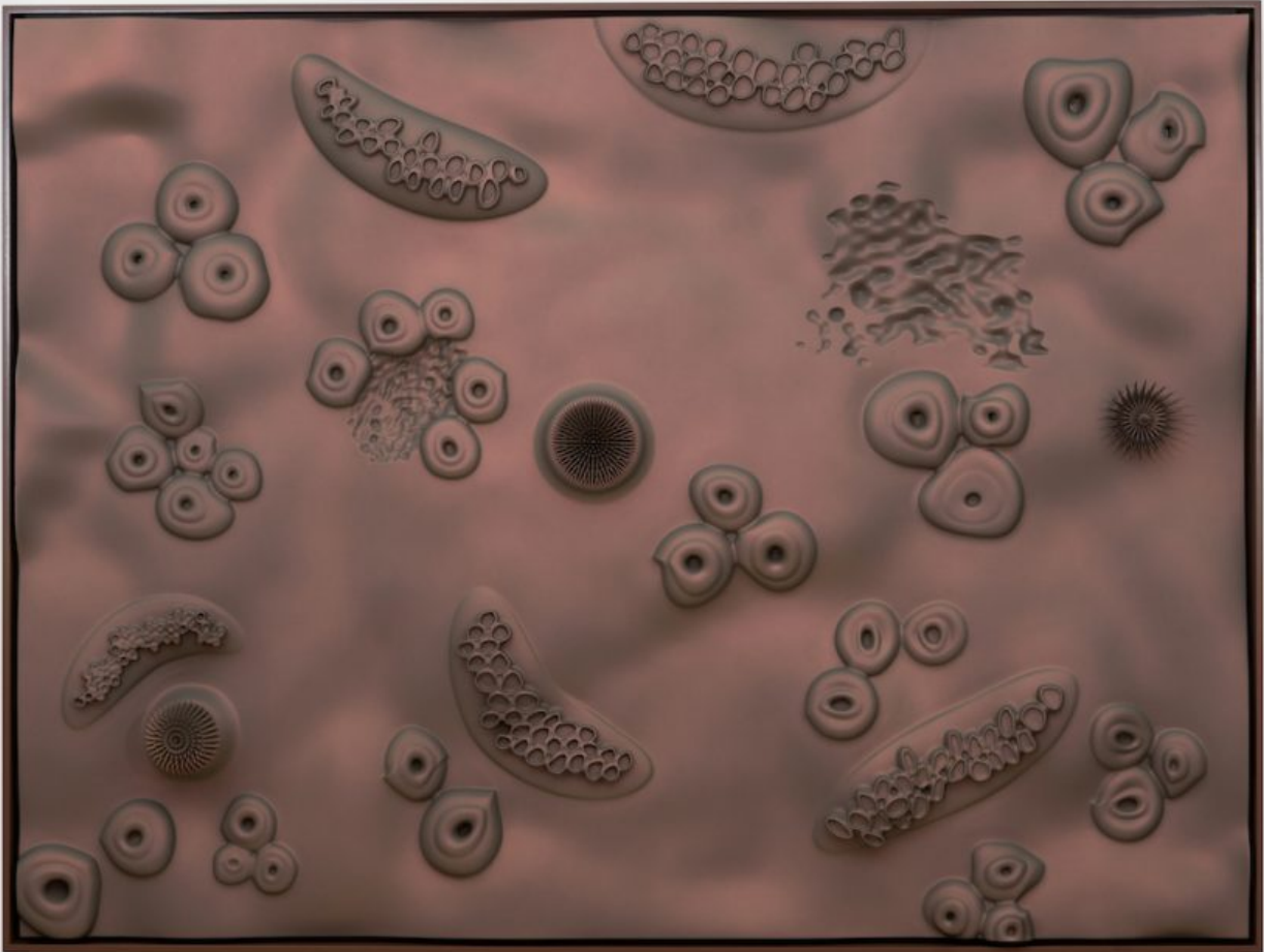
Anicka Yi, Cascade of Failure (2020).