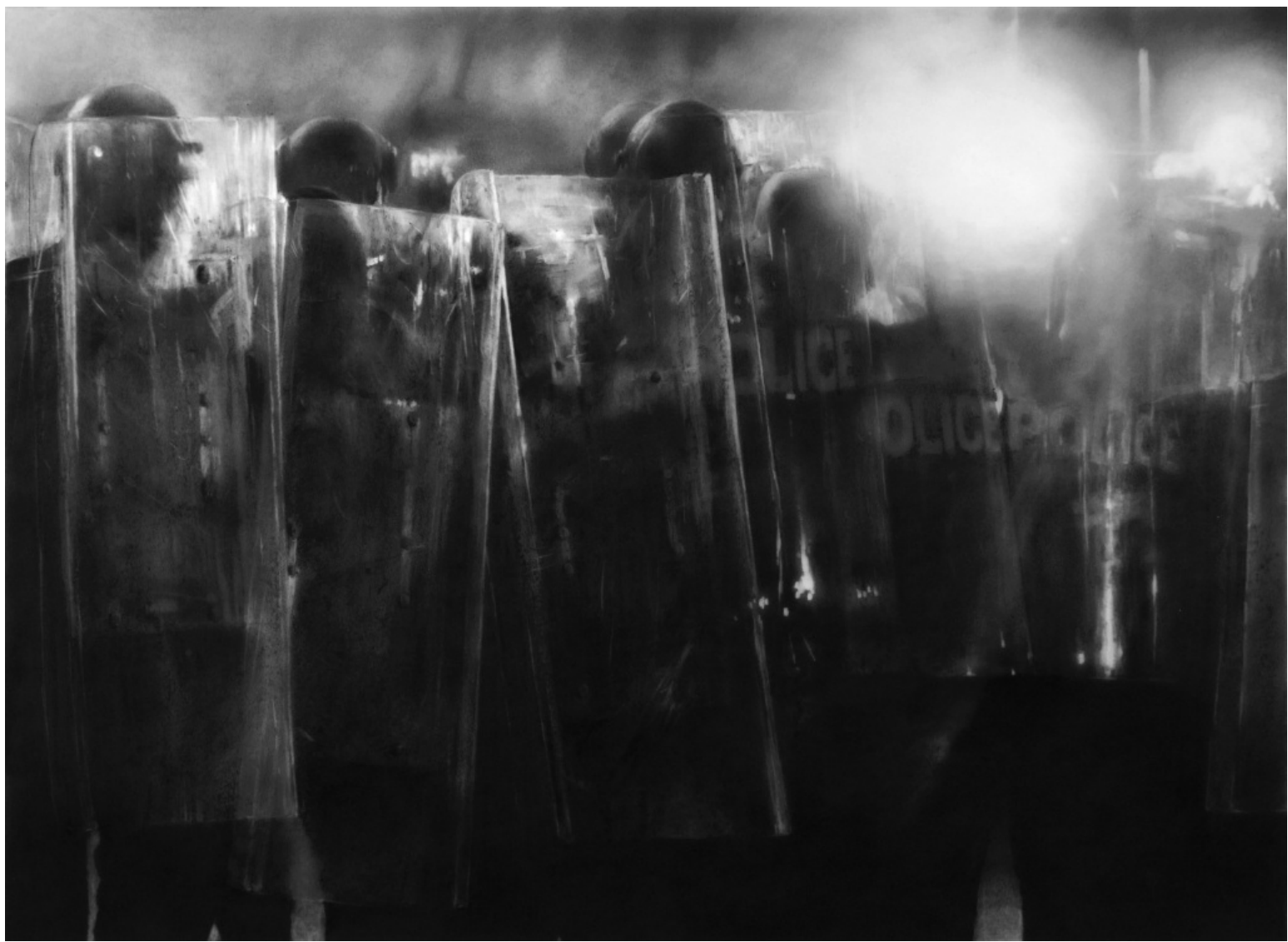
Robert Longo, Study of Rio Cops, Baltimore (2016).