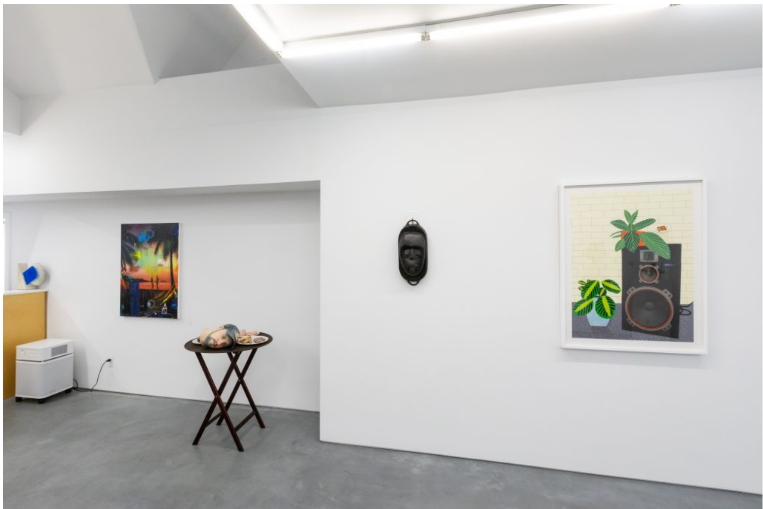
Installation view, "Friend of Ours" at Rental Gallery, July 2020.