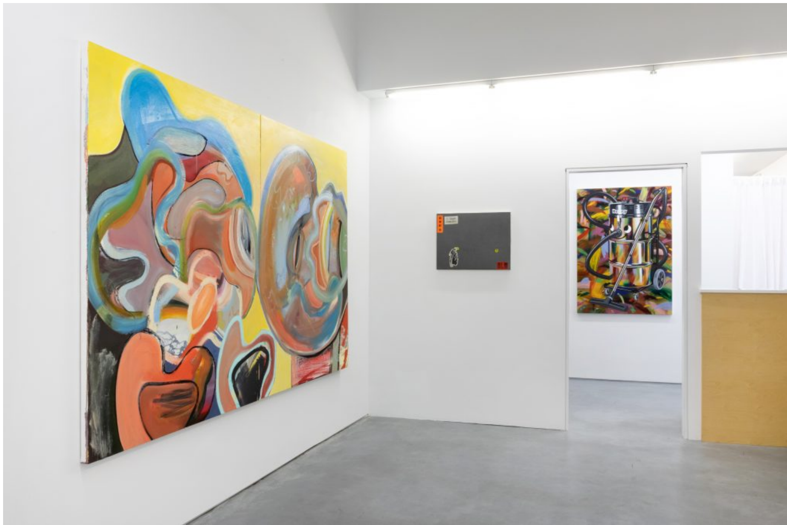
Installation view, "Friend of Ours" at Rental Gallery, July 2020.