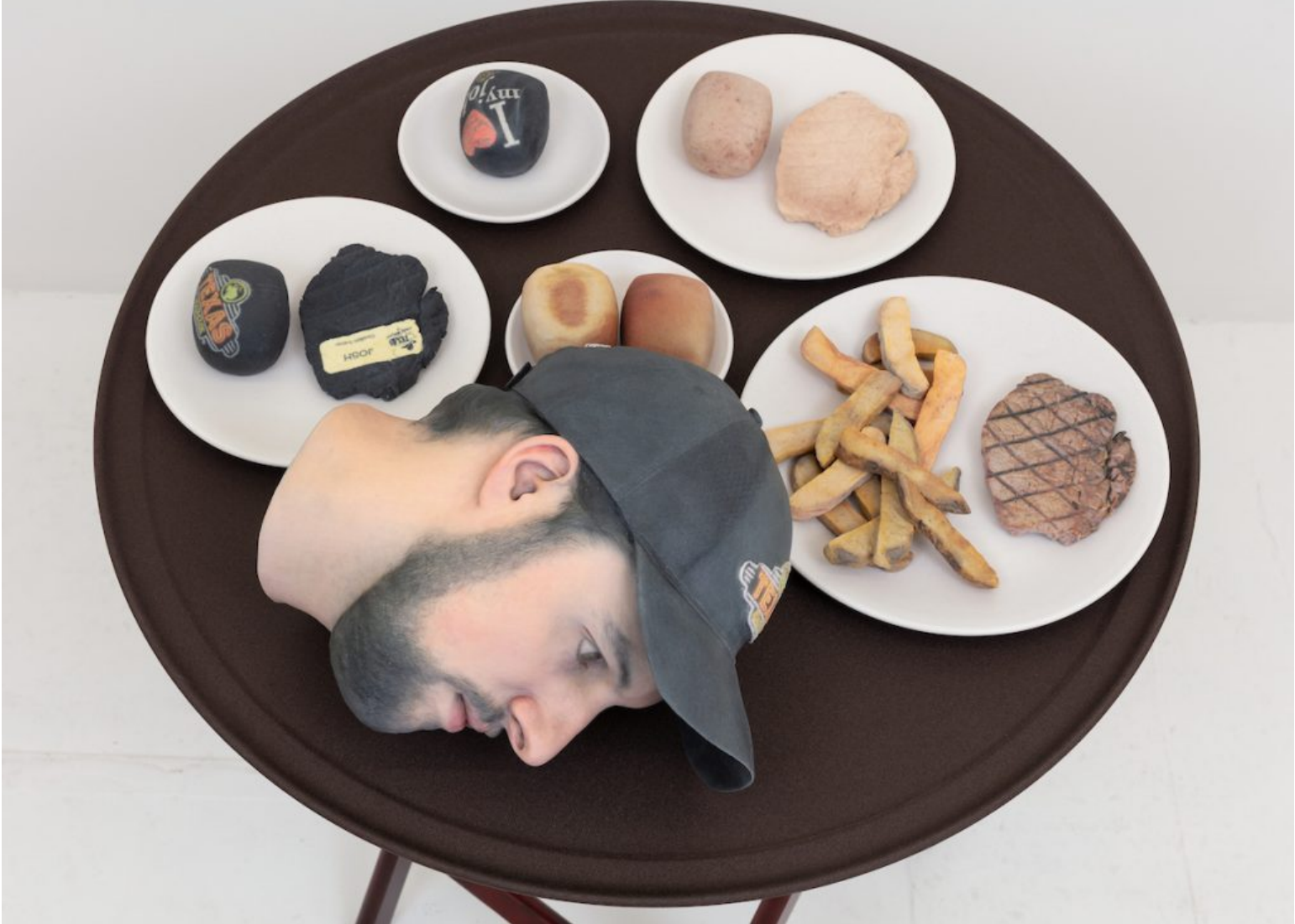
Josh Kline, Keep the Change (Texas Roadhouse Waiter's Head with Cap) [detail] (2018).