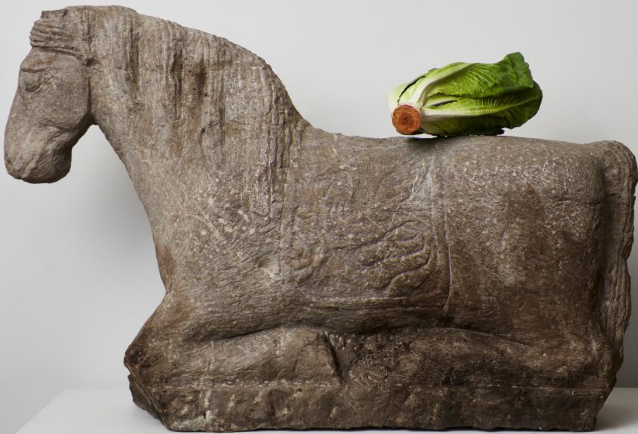
Tony Matelli, Horse (2017).

As galleries and art institutions around the world begin to reopen, we are spotlighting individual shows—online and IRL—that are worth your attention.