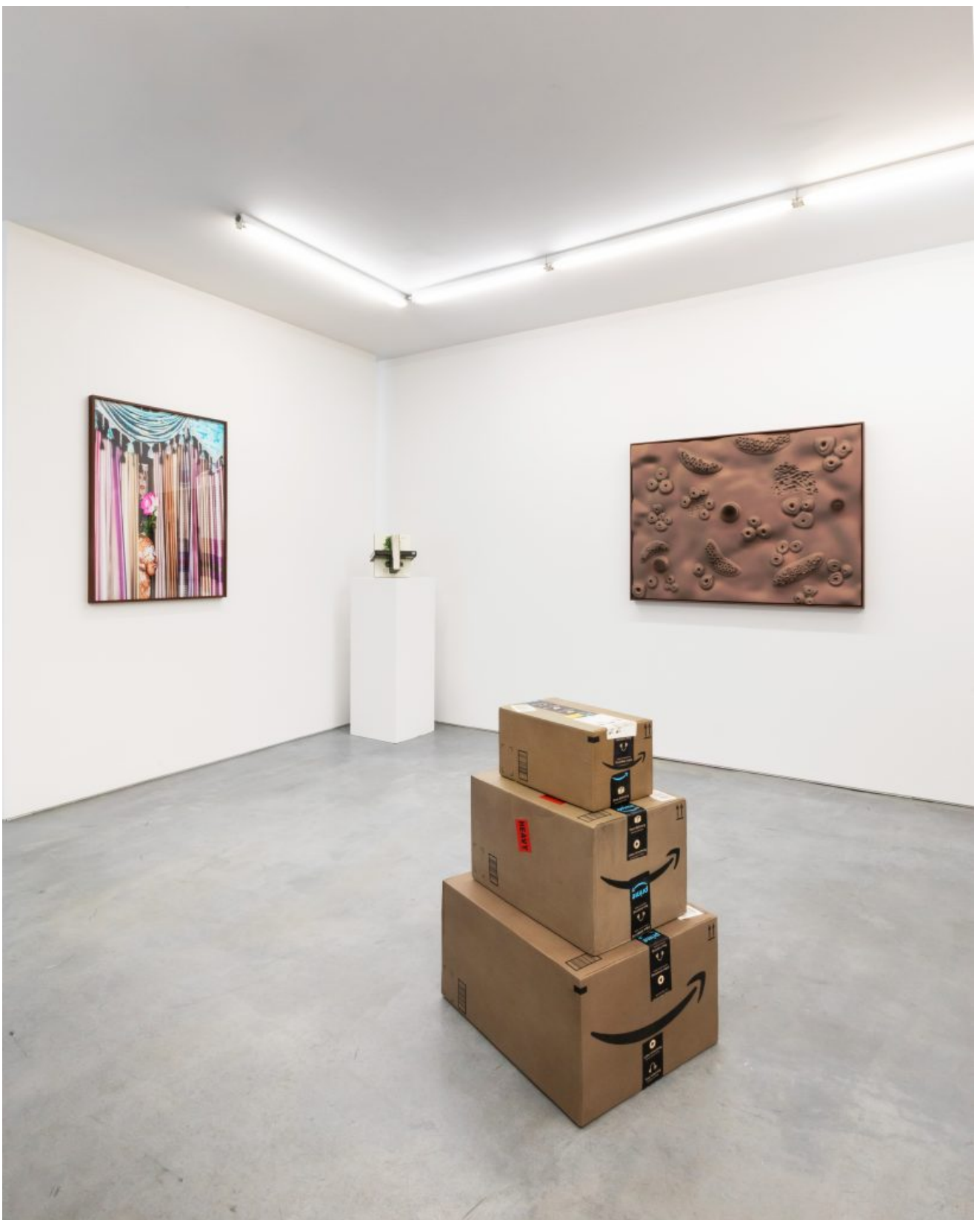
Installation view, "Friend of Ours" at Rental Gallery, July 2020.