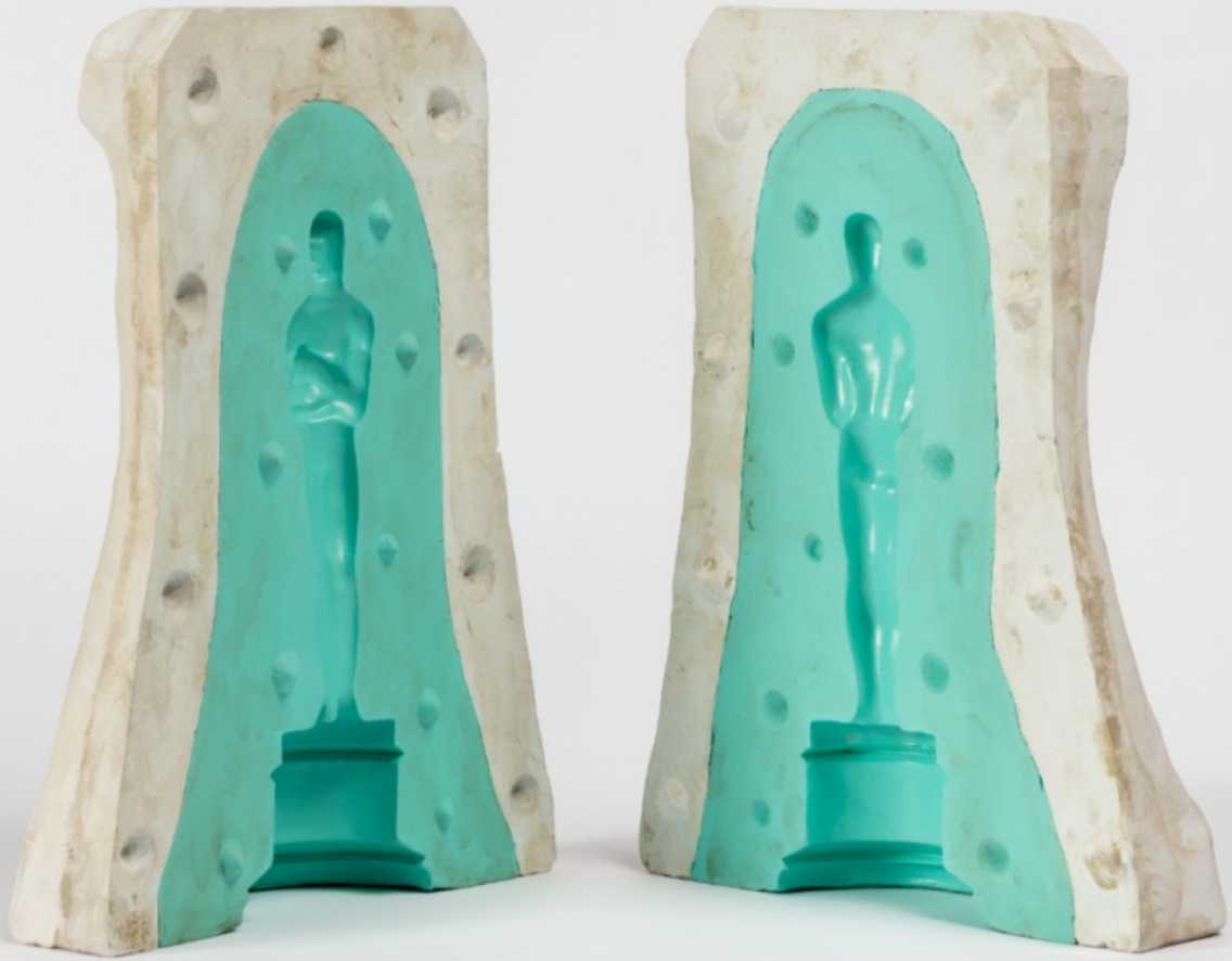
Alex Israel, Casting (2015).