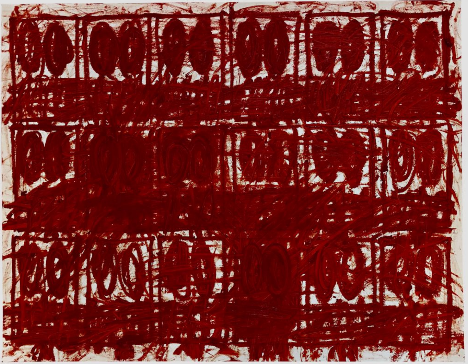
Rashid Johnson, Untitled Anxious Red Drawing (2020).