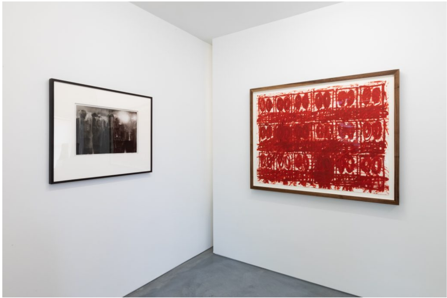
Installation view, "Friends of Ours" at Rental Gallery, July 2020.